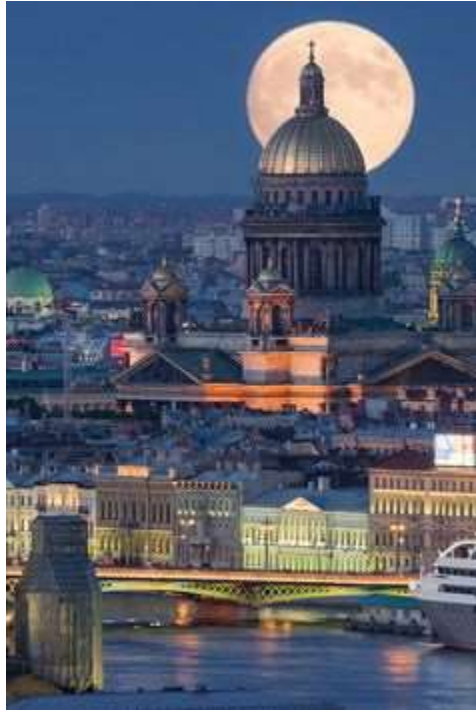
D 19 (OCT 4) | ST.PETERSBURG→ TORONTO

Enjoy your free day explore the ancient Capital of Russia. We will have a Farewell dinner tonight.